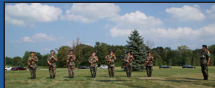
Twenty-one Gun Salute

A groundbreaking was celebrated on August 12th with Macomb Township Officials, Veterans, First Responders, families of fallen veterans, and supporters. The park will be officially dedicated on November 11, 2010, Veterans Day.